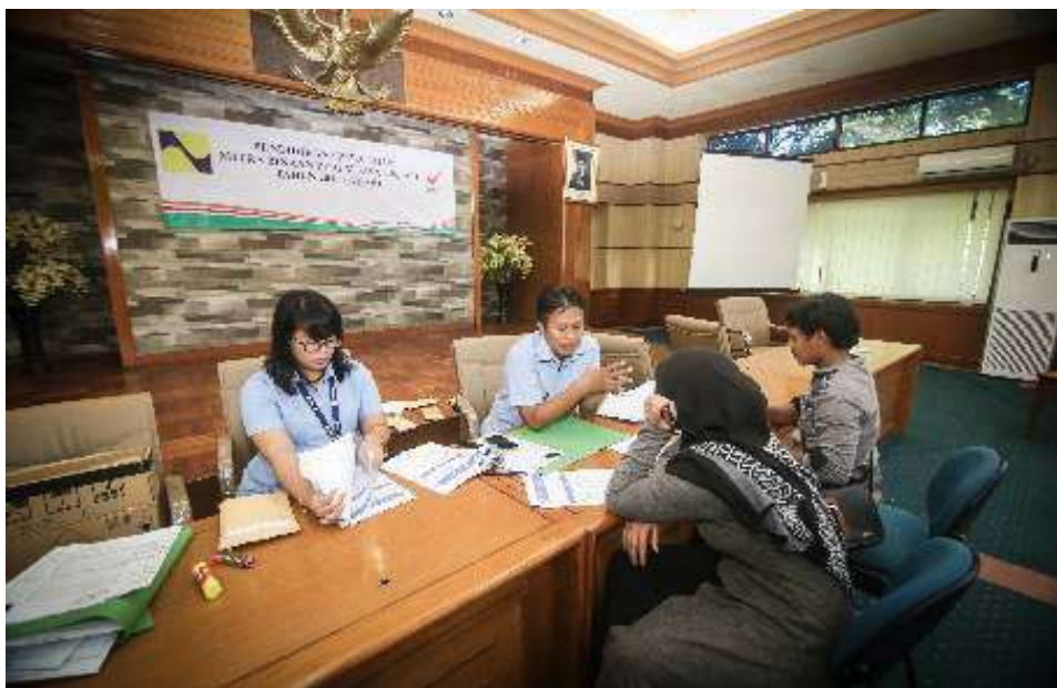
PJT II Held the Mitra Binaan Education and Training 2016