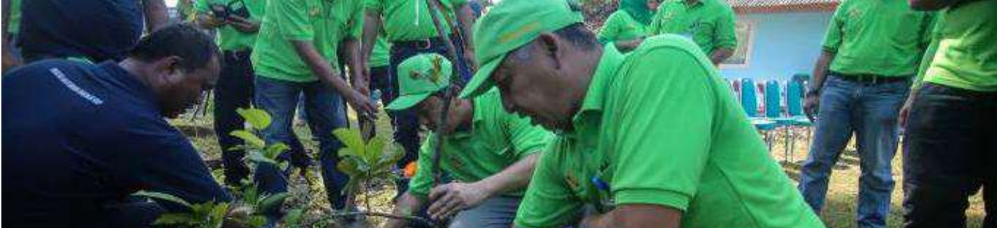
Penanaman Pohon UUW III