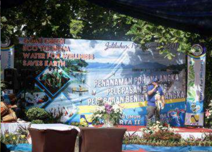
Perum Jasa Tirta II Care for the Environment