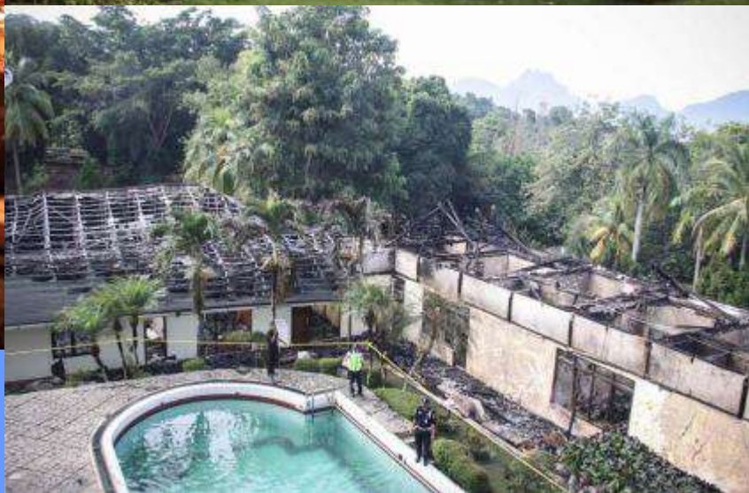
Fire at Pasanggrahan Hotel Jatiluhur

On Wednesday December 28th 2016 at 02.15 West Indonesia Time there was a fire on Pasanggrahan Hotel Tourism Area of Grama Tirta Jatiluhur. The Pasanggrahan Hotel is one of the hotels managed by Tourism and AMDK Business Unit Perum Jasa Tirta II that contains 19 rooms and some of the bungalow.